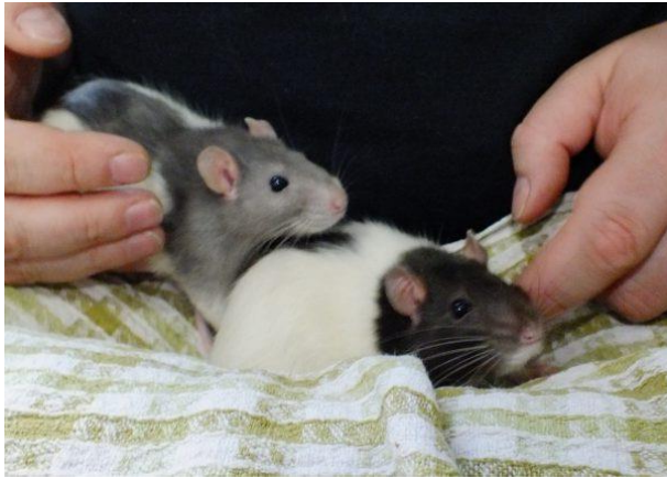
Pika and Yuki – 11 month old female rats.

These gorgeous girls would ideally like a home with their friends Luna and Sol. They are also friendly girls and like being handled.