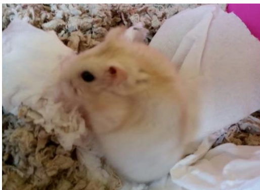
Tink – around 2 years of age. Looking for some love in her twilight years.