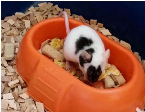
Sabrina – female mouse, approximately 1 year old.

These gorgeous girls would ideally like a home with their friends Luna and Sol. They are also friendly girls and like being handled.